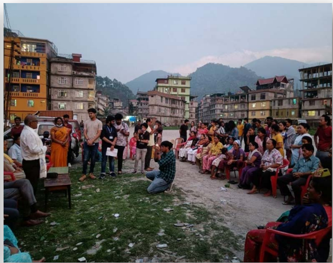
IBM-Slum area- People gathering for the inaugural event