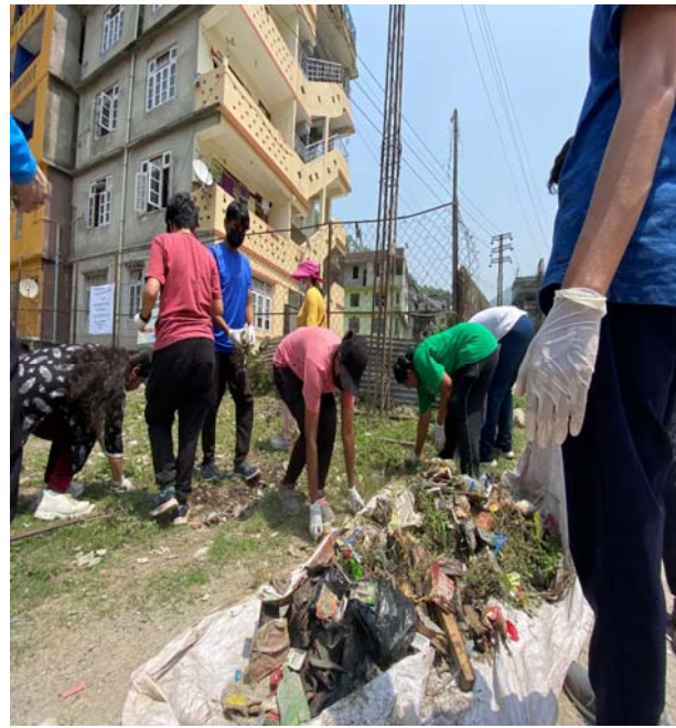
Volunteers motivated local resident to keep the surroundings clean and educated them regarding dry waste and wet waste.