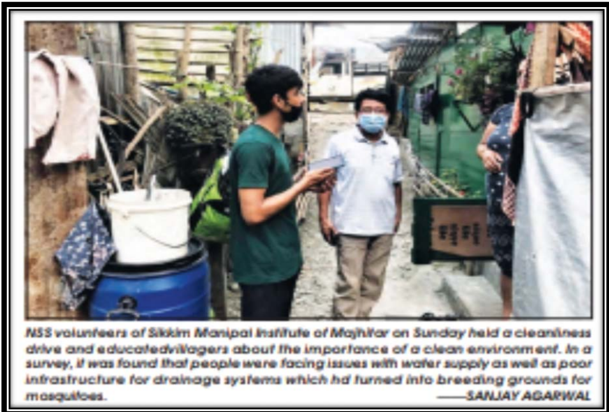
NSS volunteers of Sikkim Manipal Institute of Majhitar on Sunday held a cleanliness drive and educated villagers about the importance of a clean environment. In a survey, it was found that people were facing issues with water supply as well as poor infrastructure for drainage systems which had turned into breeding grounds for mosquitoes. — SANJAY AGARWAL