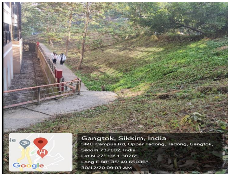
Pedestrian Friendly Pathway from Hostel towards Academic Block (Medical Campus)