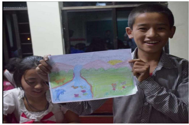
Students enjoying Seed School at Technical Campus